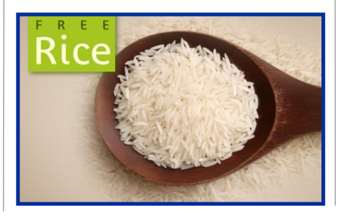
Cougar Prints 7

<u>FreeRice.com</u>: play and learn while donating rice through the United Nation's World Food Program. Registration is not required. Select subject (SAT prep, geography, chemistry, etc.), set the level of difficulty, and play. Rice accumulated by correct answers helps end world hunger.